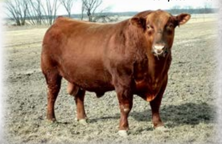
RRA Conquest 124-495