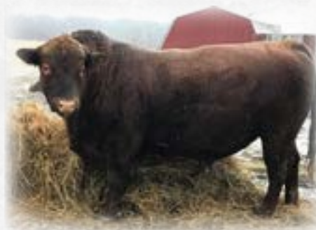
Copperas Creek Wide Load Sire to Lot