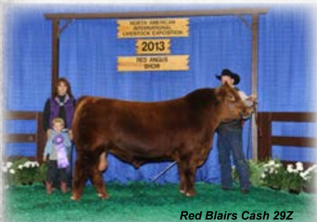
Red Blairs Cash 29Z