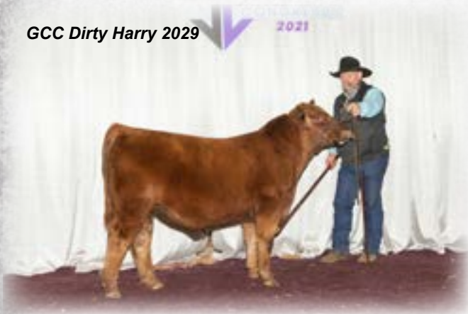
GCC Dirty Harry 2029

GCC Dirty Harry 2029 is a young bull that we are very excited about. He was the lead off bull in our Pen of 3 bulls in the National Red Angus Pen Show in OKC. We believe he is the power bull that the breed is looking for. He is a 495 son out of a 6 year old Makin Hay cow that will likely be a donor female for us. He came in at weaning time off of nothing but grass, sunshine and momma's milk at 770 pounds. He blows the growth numbers out of the water ranking in the top 1% WW, 1% YW, 2% ADG and 10% REA. Being a May born calf we have not collected him yet but will sometime in April. The buyer will pay for this lot upon a successful collection. Here is a chance to get into our leading edge genetics.