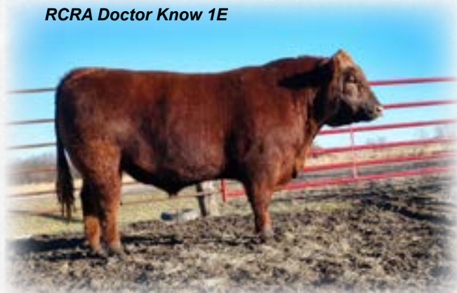
RCRA Doctor Know 1E