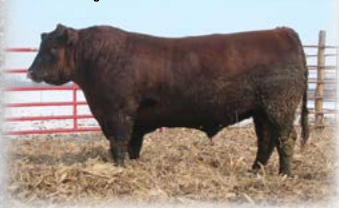
RCRA Think Again 4E