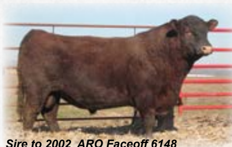
Sire to 2002 ARO Faceoff 6148