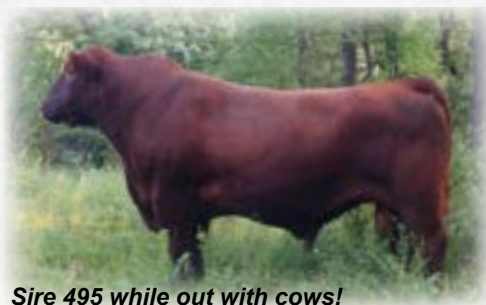
Sire 495 while out with cows!