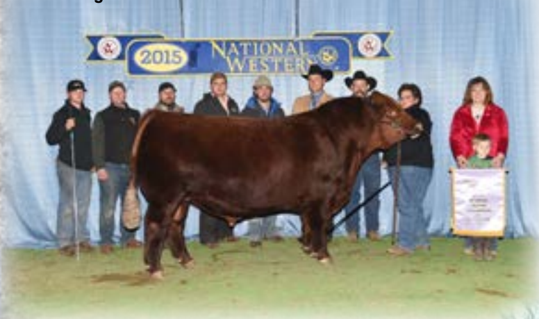
GCC Navigator 1233

GLACIER LOGAN 210 RED PFRA MS LOGAN 109L (1824443) RED PFRA MARTA 121E