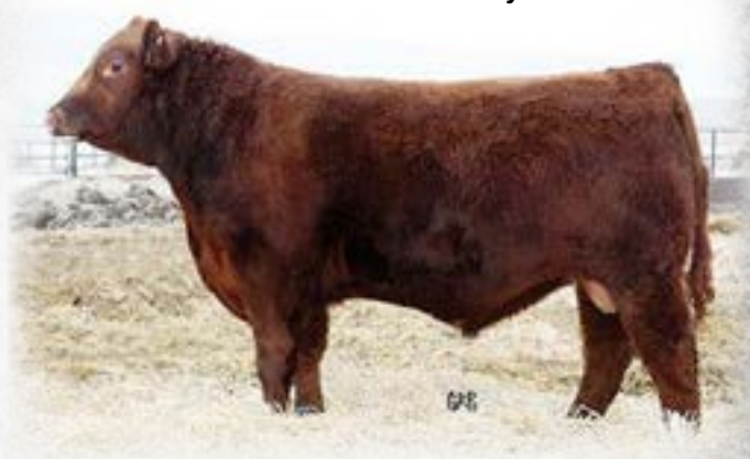
Red Brylor Walkerton 10W

RED GEIS PRIME RIB 411 RCRA GLORIA 546W (1392750) SIX MILE GLORIA 546S